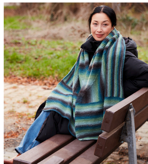
R0455 Elongo XL scarf, REGIA Virtuoso Color col. 03071